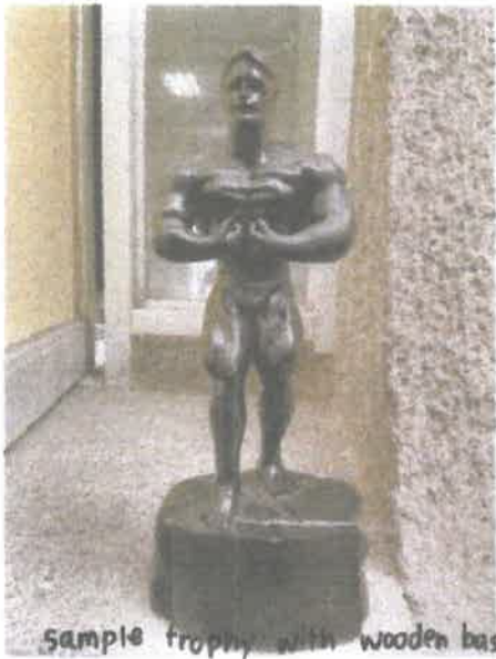
sample trophy with wooden base