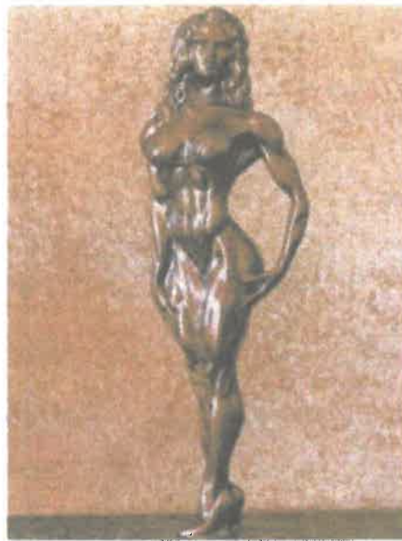
Pose A 5pcs assorted sizes