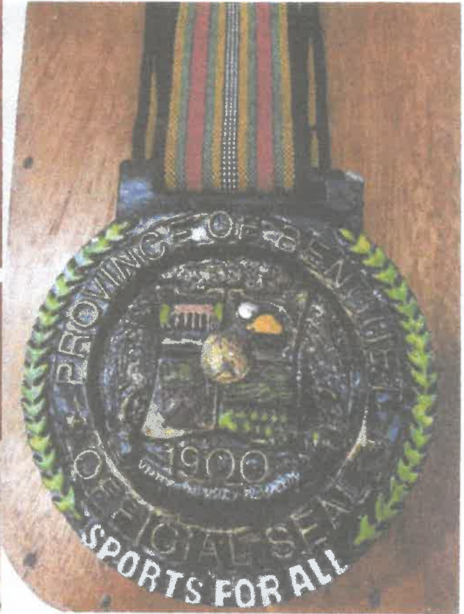
sample of medal