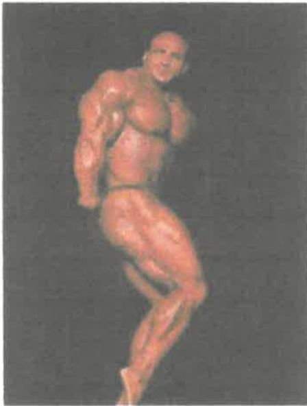
pose c 30pcs assorted sizes