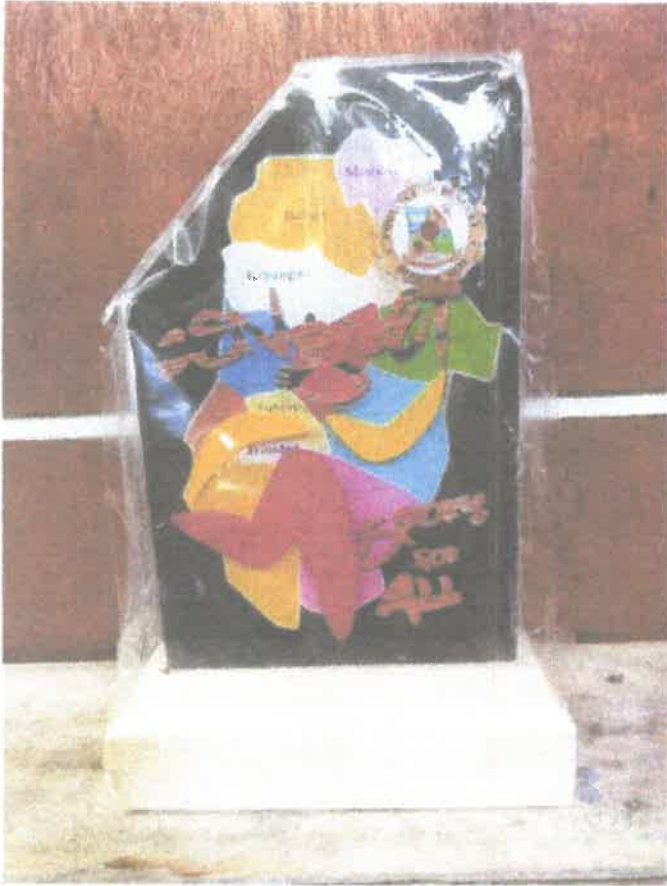
sample of sports trophy