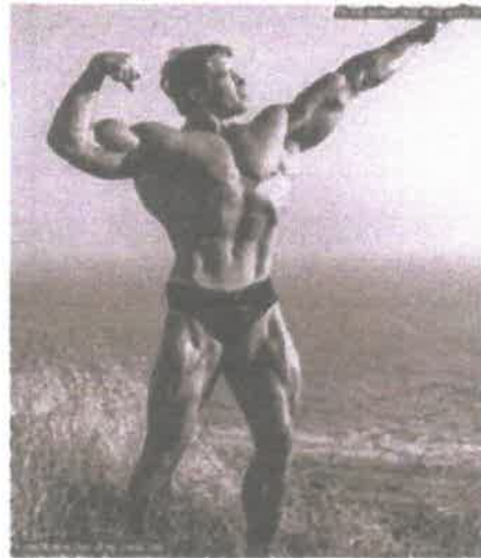
pose D 5pcs same sizes