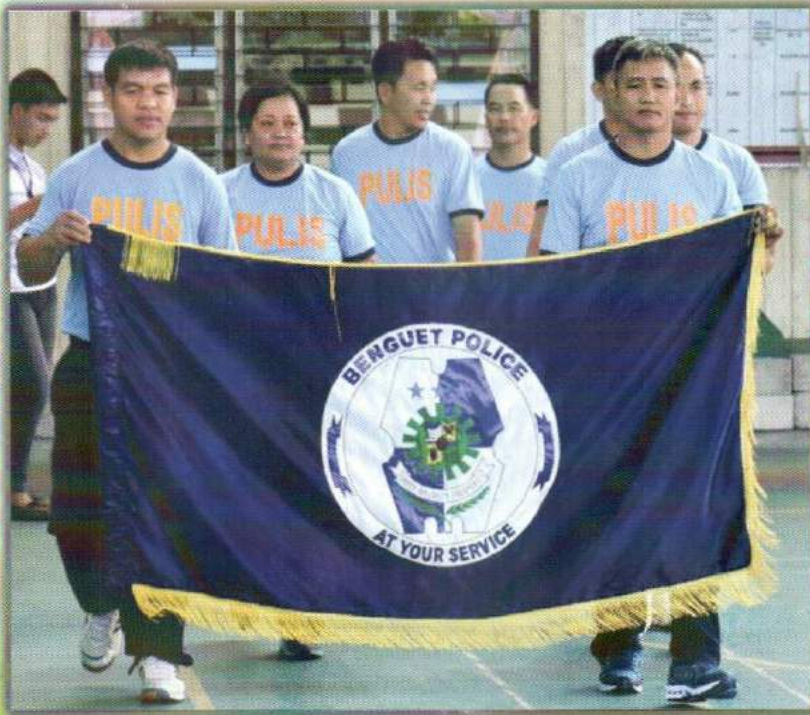
Benguet Provincial Police Office athletes during the Inter-agency sports opening program