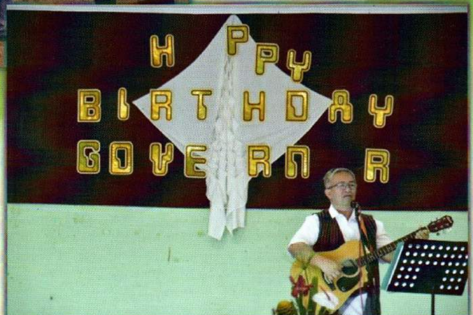
The singing Governor during his birthday