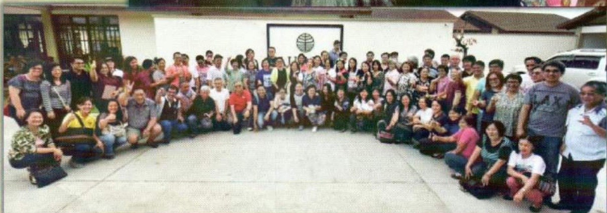
Participants to the Strategy Planning on Strengthening Local Governance in La Union