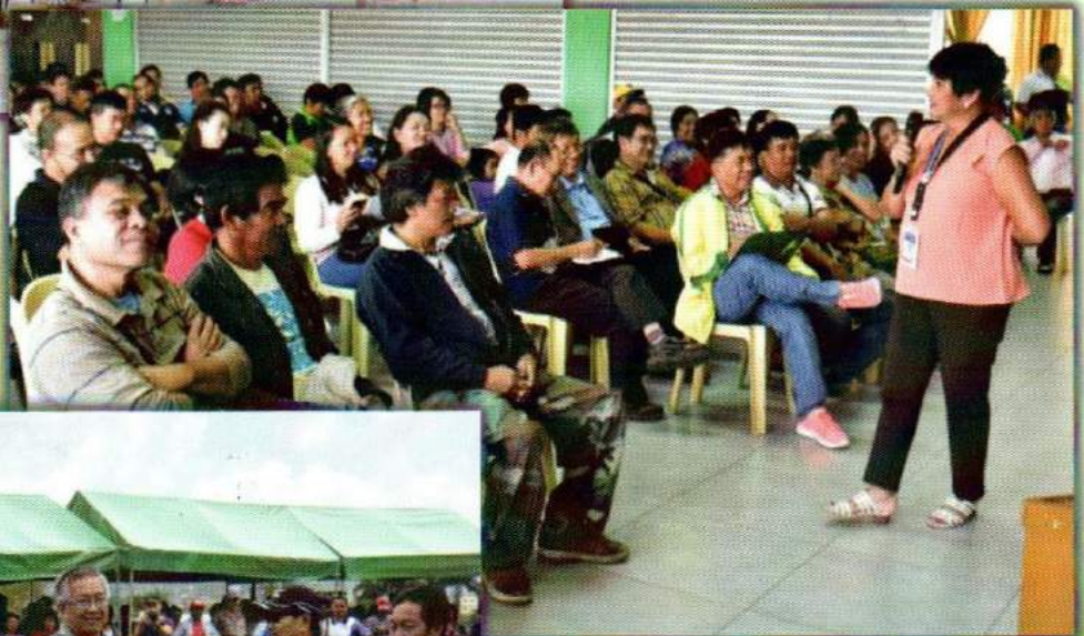
Coop Education Seminar for Transport Services held at the Gov Palispis Hall, Benguet Provincial Capitol