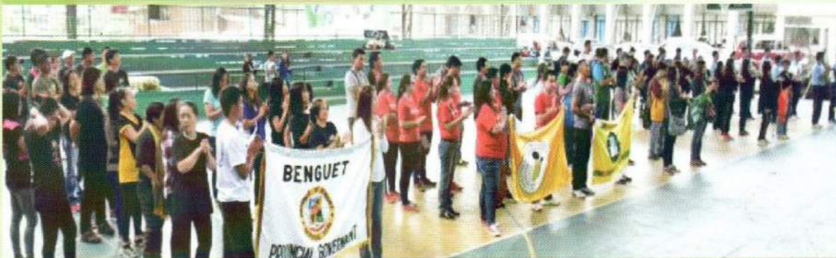
The different sportsmen-delegates during the Opening Program for the Inter-agency sports tournament