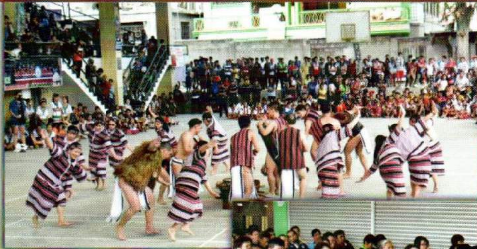
BCEPAG invited and performed during the Lang-ay Festival of Mt. Province