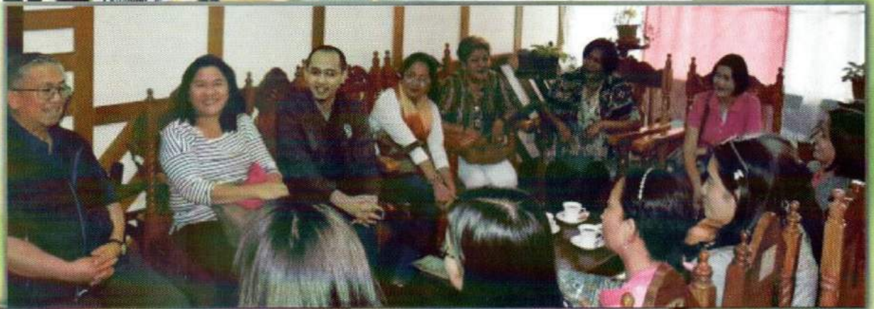
A courtesy call from the officials and employees of Hermosa, Bataan