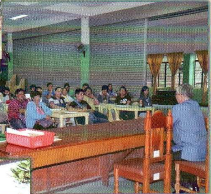
Orientation of accepted agri trainees to Kochi, Japan