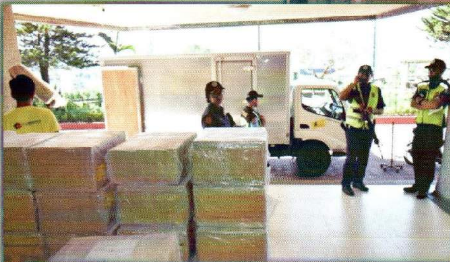
Ballot boxes for the SK and barangay elections being unloaded and inspected